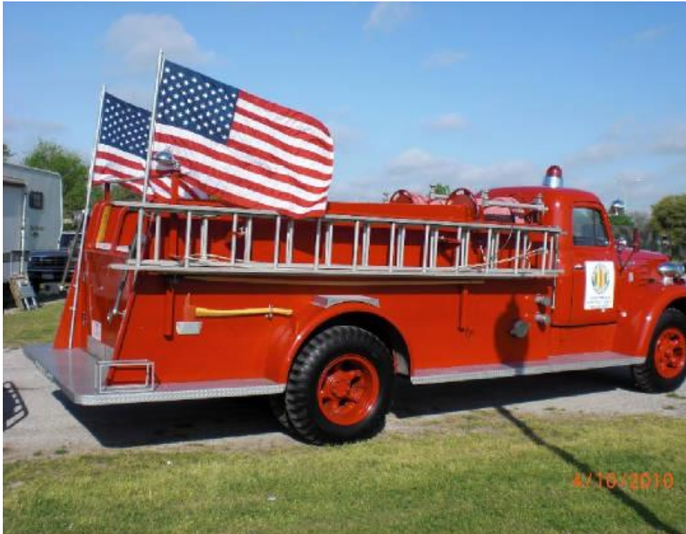
Medal Of Honor Parades aren't complete without Raines bright Re Fire Truck.