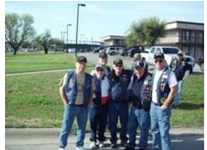
Patriots! What a great site.