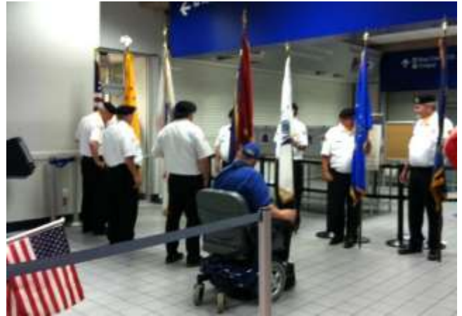
VVA Honor Guard May 2013