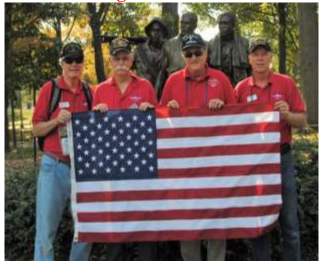
Honor Flight #16 - October 2016

“Never Again Will One Generation of Veterans Abandon Another”