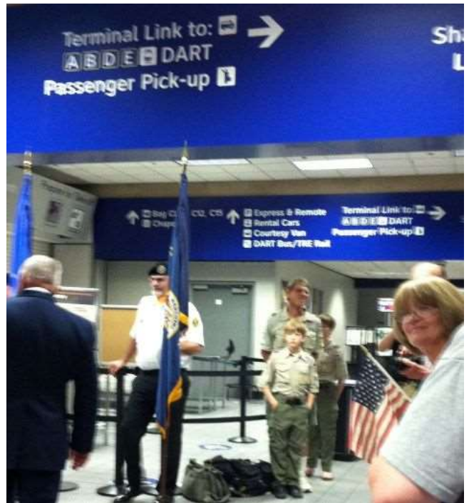
Boy Scouts Honor WWII Veterans