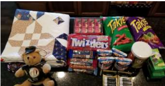
Quilt provided by Denton Quilt Guild.