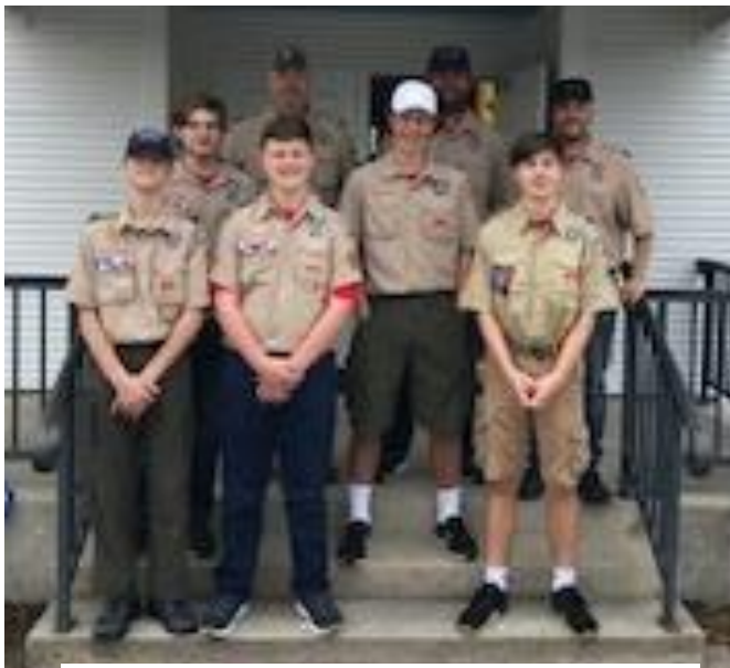
BSA Troop 1656 was enroute to Camp Filmont in New Mexico.